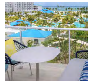
Family friendly Wave section