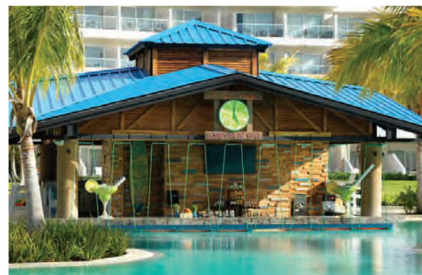
5 O'Clock Somewhere Bar

Contact your Bestbuy member distributor to register for the 2024 SunSplash trip. More information coming soon!