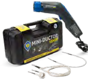
Mini-Ductor Venom Handheld Induction Heater IND-MDV777