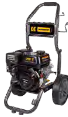
2,700 PSI - 2.3 GPM Gas Pressure Washer BEP-BE276RA PowerEase 6HP engine.