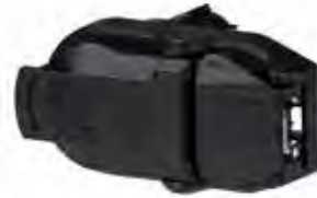
OEM Replacement Dual-Out- put 7 & 4-Way Connector (Plugs into Any US CAR)