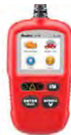
Handheld 1 System Code Reader AUL-AL329