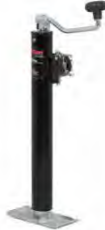
Pipe-Mount Swivel Jack with Top Handle (5,000 lbs, 15" Travel)