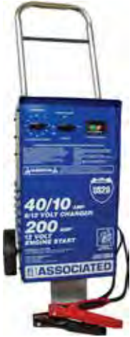
Charger, 6/12V 40/40/10A, 200A Cranking Assist, Wheels (With Timer) ASS-US20