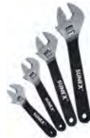
4 Pc. Adjustable Wrench Set SUN-9618A 6", 8", 10", 12"