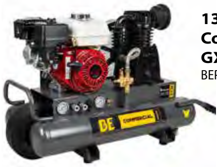
13.8 CFM @ 90 PSI Gas Air Compressor with Honda GX200 Engine BEP-AC658HB