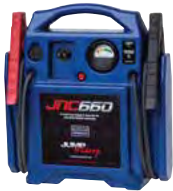
1700 Peak Amp 12 Volt Jump Starter SOL-JNC660