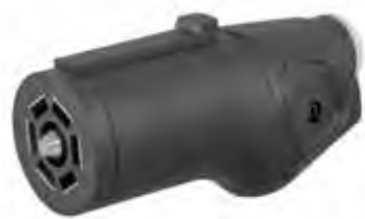
Heavy-Duty 7-Way RV Blade Connector Plug (Trailer Side)