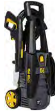
1,700 PSI - 1.7 GPM Electric Pressure Washer with PowerEase Motor and AR Axial Pump BEP-P1715EN