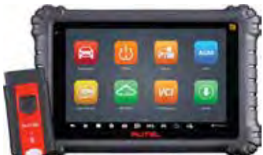
MaxiSYS Advanced Diagnostic Tablet with Bluetooth VCI200, Complete TPMS Servicing, 8" Touchscreen, Android 7.0 Operating System