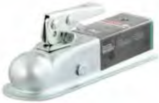
2" Straight-Tongue Coupler with Posi-Lock (3,500 lbs, Zinc)