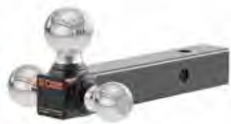
Multi-Ball Mount (2" Hollow Shank, 1-7/8", 2" & 2-5/16" Chrome Balls)