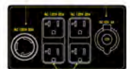
GFCI Outlets - Plug in power tools & charge devices

Power your appliances Perfect for portable chargers & compressors